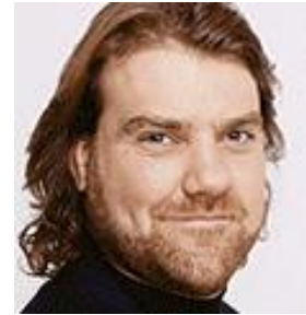
Mystery Celebrity (60 across)